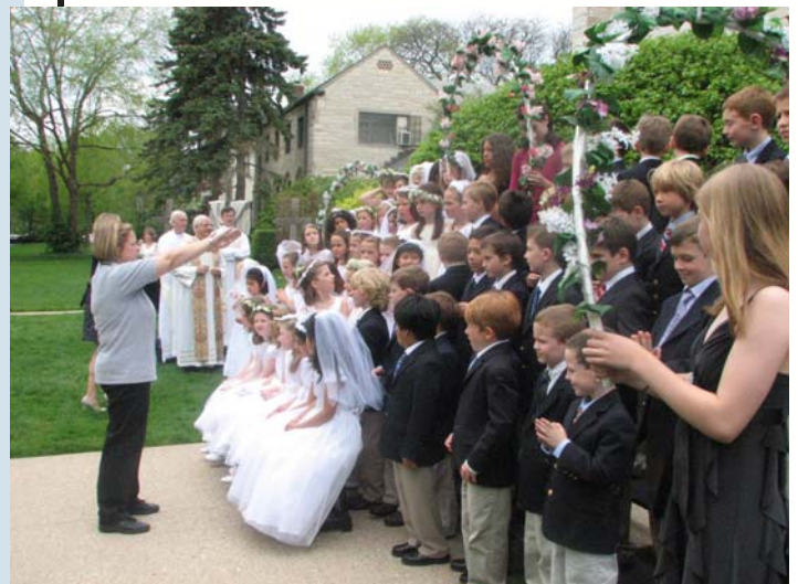
First Communicants Pose for a Group Photo

is celebrated on Saturdays, after the 8:15 am Eucharist until 9:30 am, in the sacristy near the front doors of the Church during the Holy Hour. Communal Reconciliation Services are held during Advent and Lent.